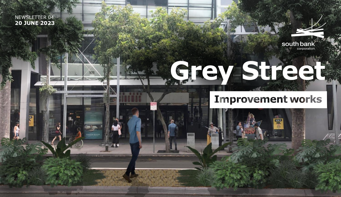
Artist impression of an indicative outcome.