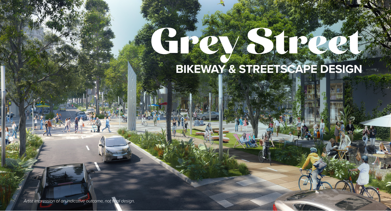
Artist impression of an indicative outcome, not final design.